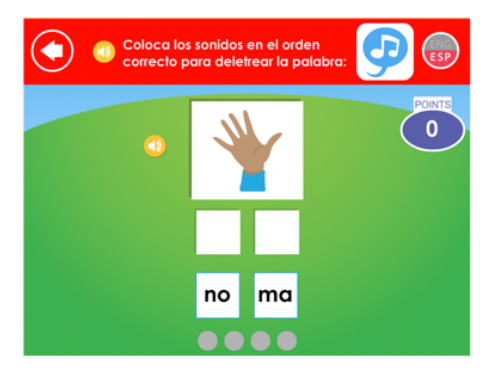
Spanish mano (hand) 2 open syllables