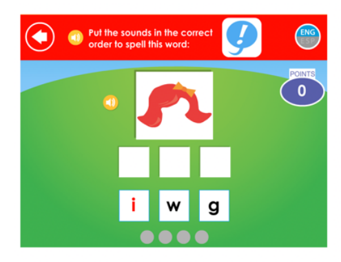
English wig c-v-c