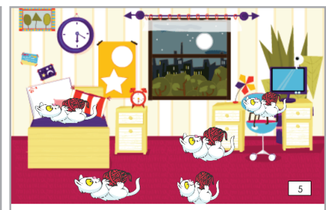
Estos son gatos siguro tu conoses estos animales toma leche y esta bien suave.Pero no le gusta agu.