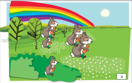
Estos son los conejos los conejos comen zanaoria,plantas y toman agua los conejos viven arededor