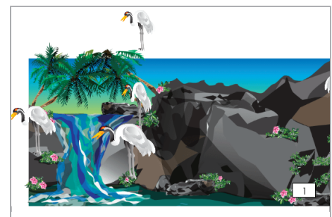
Estos son flamingos pueden aser blancos y rositas y comen pescados.