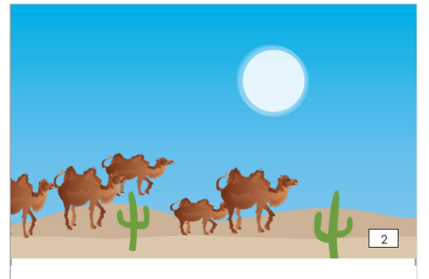
Estos son camellos y viven en el disierto buscan pasto.