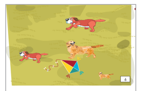
Estos son perros comen comida de perro y toman agua estan suavesitos.